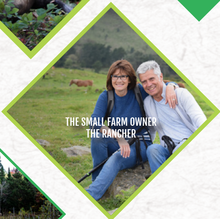
THE SMALL FARM OWNER THE RANCHER