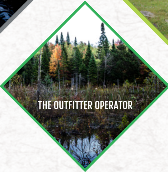
THE OUTFITTER OPERATOR