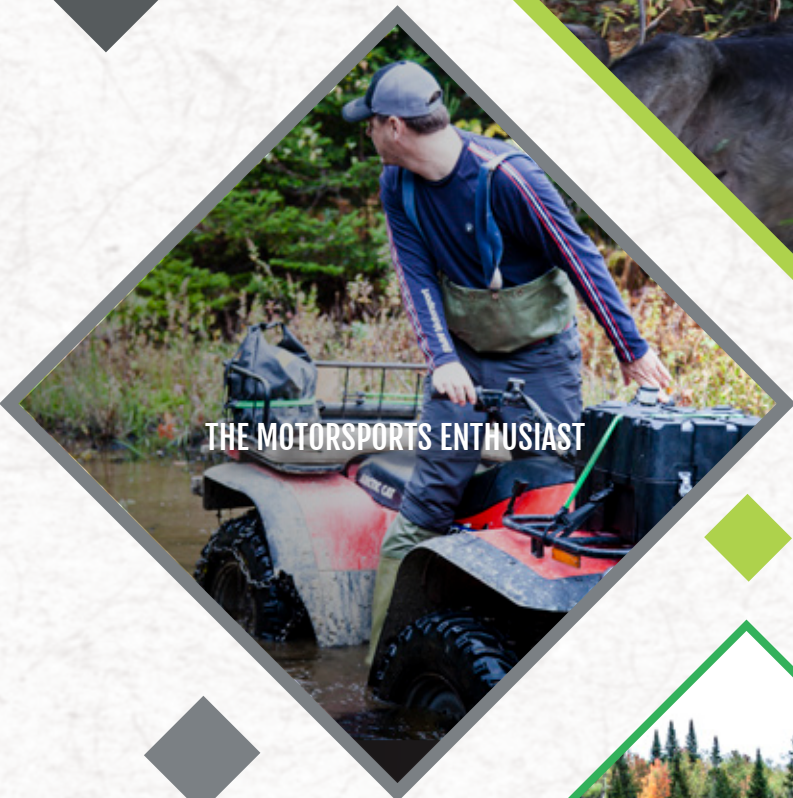
THE MOTORSPORTS ENTHUSIAST